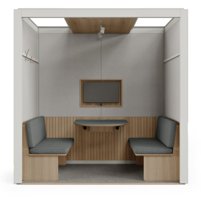
Open Meeting Room

A thoughtful space for one-on-one conversations and small group discussions.